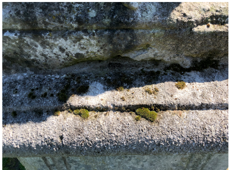
S2 detail leg S2 detail plinth