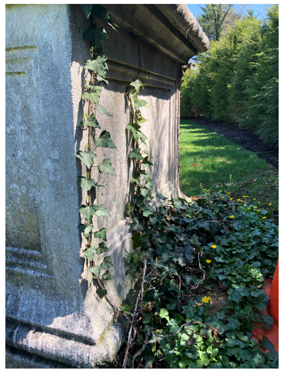
S1 ivy plants on plinth