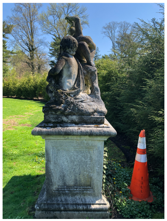
S1 PL side