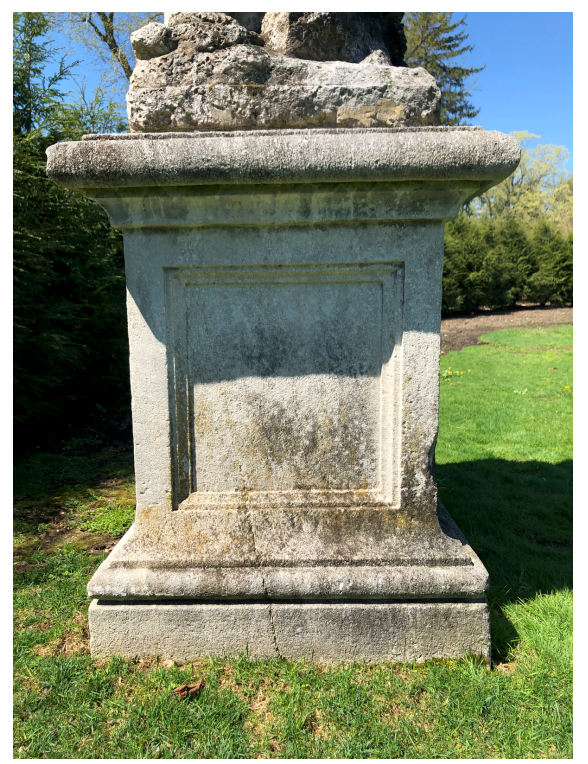
S2 PR side plinth