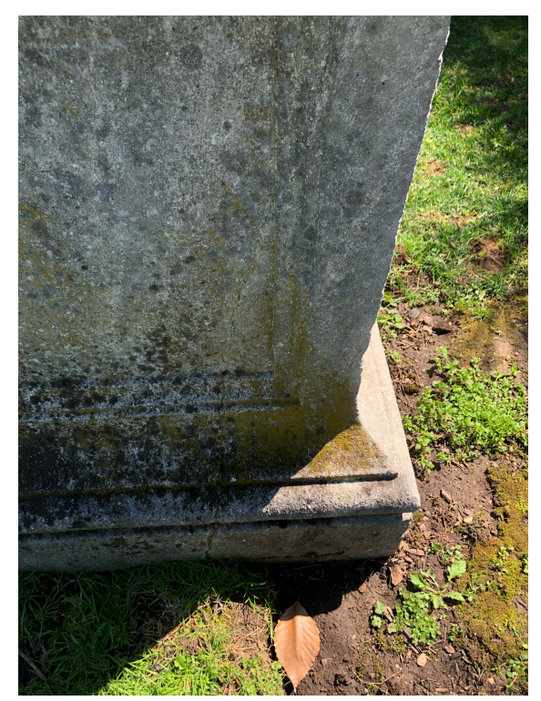
S2 plinth base detail