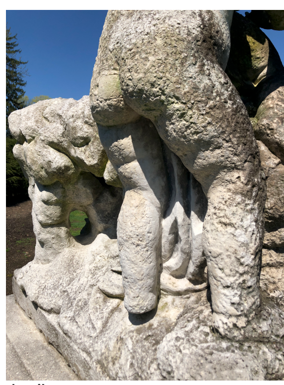
S2 back detail