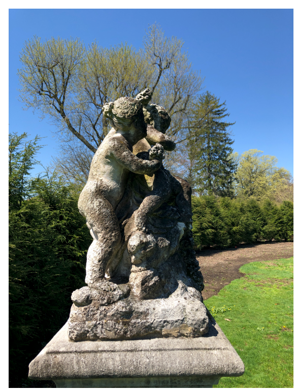
S2 PR side sculpture