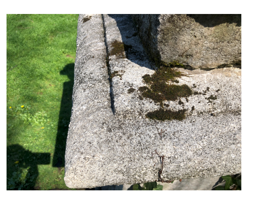
S1 crack, delamination on plinth