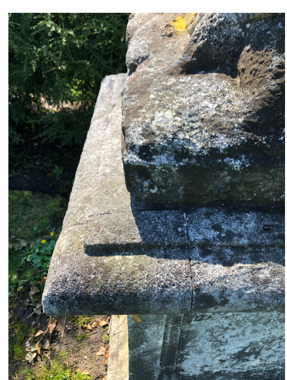
S1 dutchman corner plinth