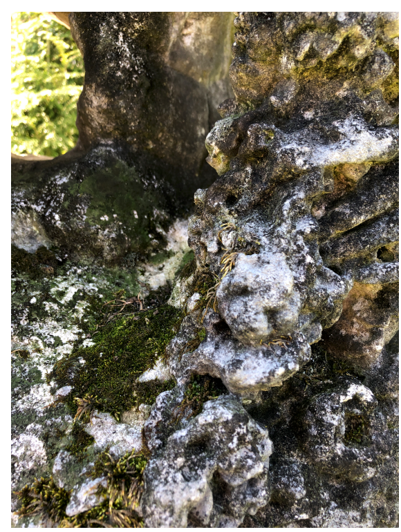
S2 growth, deterioriation