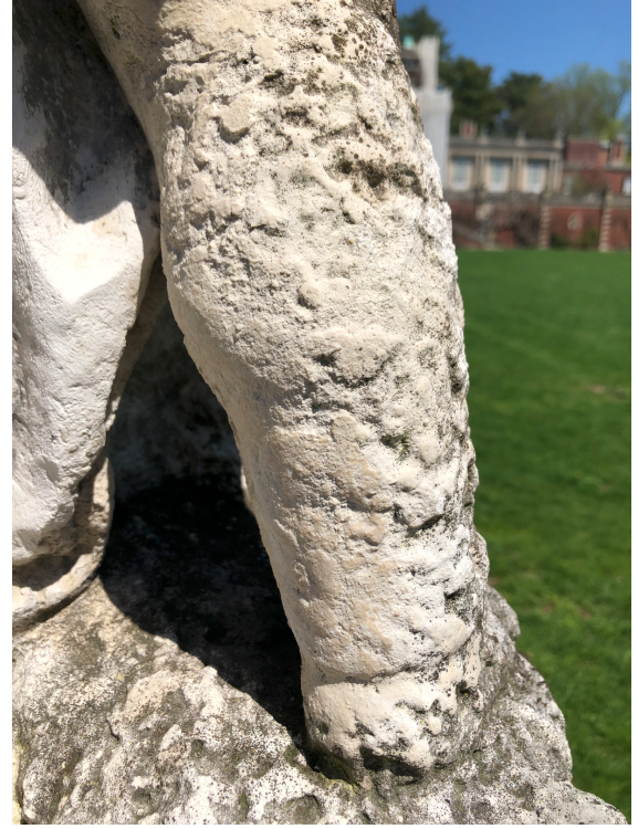
S2 plastic fill prior repair