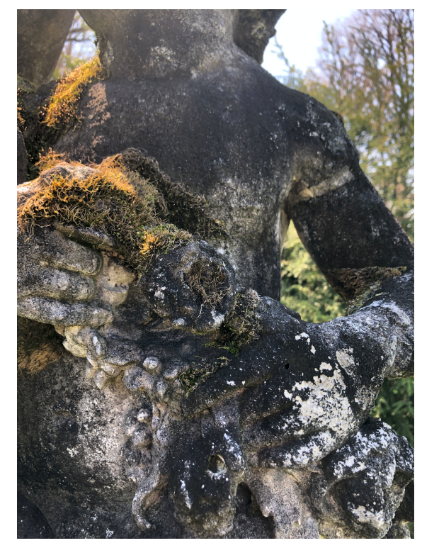
S1 condition detail