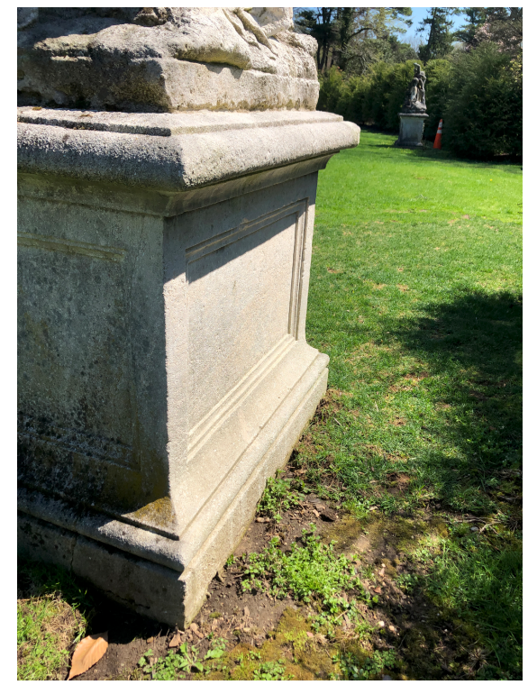
S2 plinth back