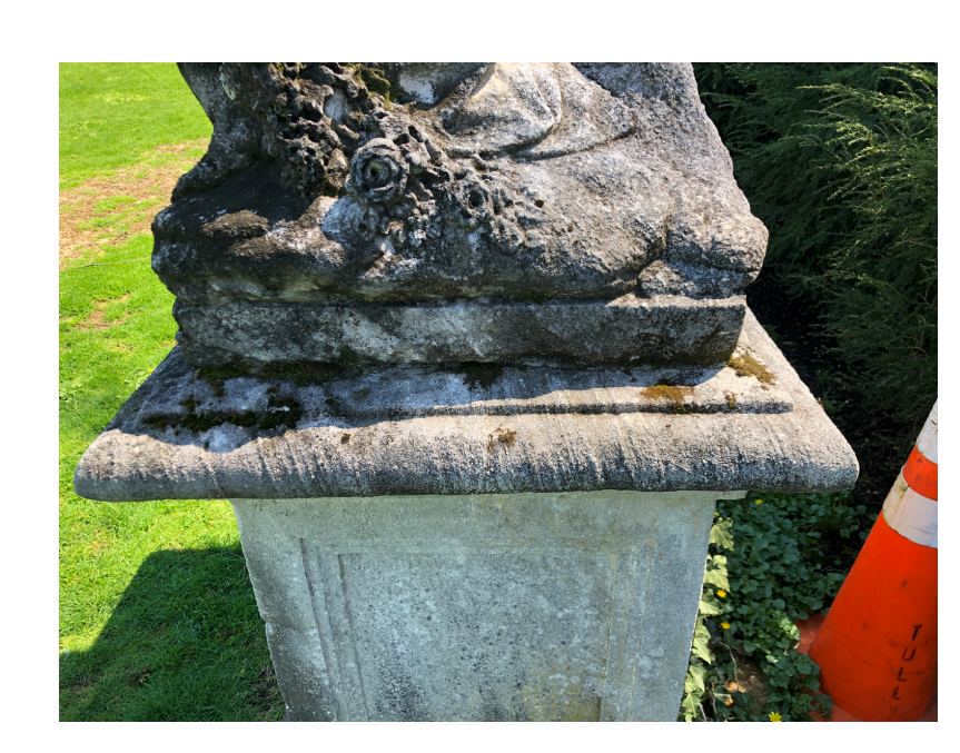
S1 base of upper