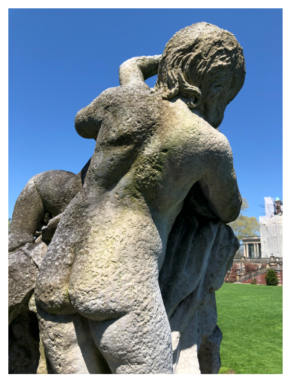
S1 back deterioriated stone; surface loss