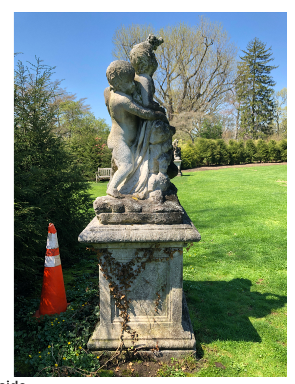
S1 PR side