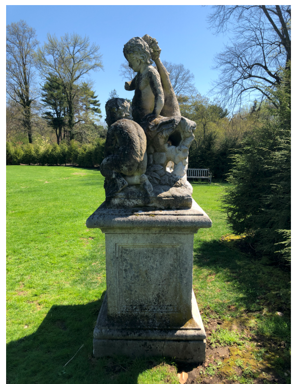
S2 PL side