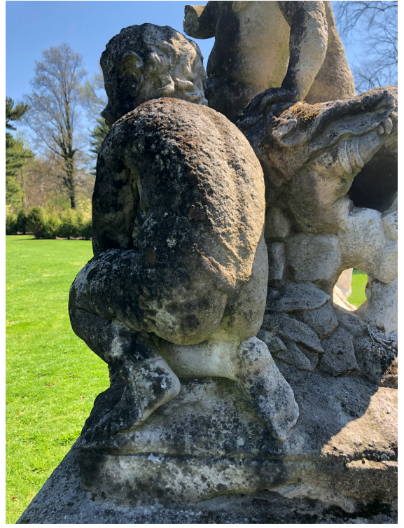
S2 detail PL side